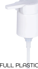
FULL PLASTIC PP CP-CP-20A

18/410 20/415 18/415 24/410 20/410 28/410