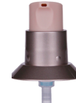
FULL PLASTIC PP CP-CP-55

18/410 20/415 18/415 24/410 20/410 28/410 Plastic